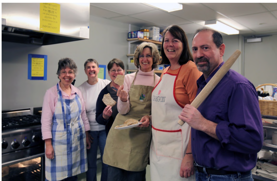
Matzah Test Baking